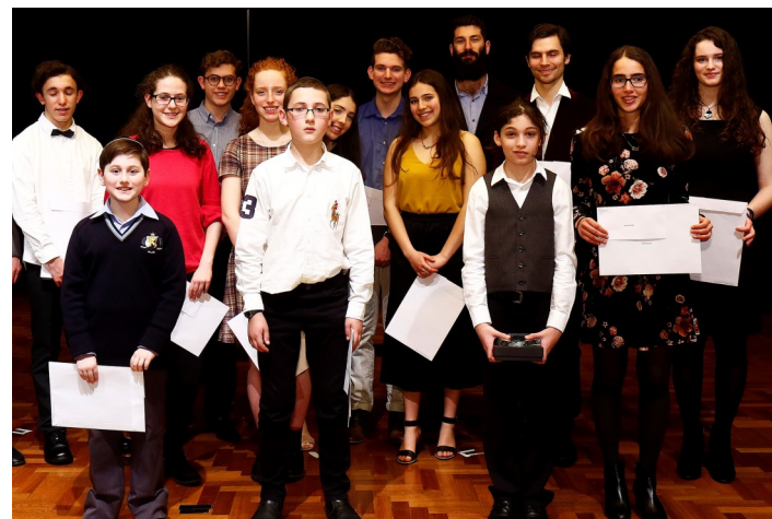
2017 Eisteddfod Winners

Potential Grand Prize finalists will be nominated by the Adjudicators. The successful $1,000 Grand Prize winner will be named at the end of the Finals Concert.